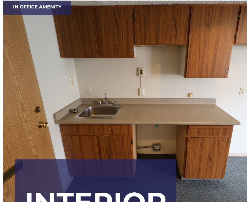
IN OFFICE AMENITY